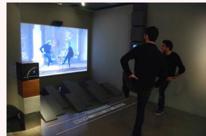
Sitting on virtual chairs at Teloglion Foundation of Art

An additional area of application is the field of advertising, as the content of the system can be suitable for promotion of any type of products.