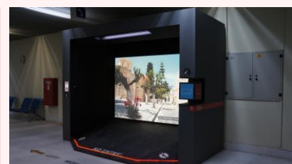
"Be There Now!" setup at Chania Airport