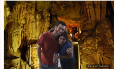
An indicative photo taken at the scenery of a cave

The implementation of this system involves computer vision technologies for the users' background removal and image acquisition.