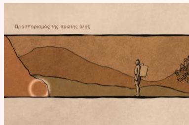
Mini-game with animated avatar