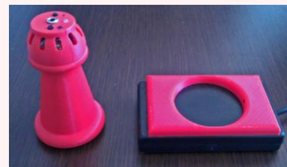
Infoscope device and PC docking station

Infoscope can be used in various application domains where location-based knowledge discovery is needed. Up to now it has been experimentally used, evaluated and tested with representative users in two application domains: (a) museum guides and (b) knowledge discovery toys for toddlers and young children.