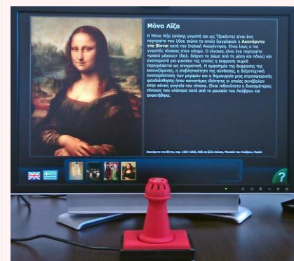
Docking Infoscope to its station for retrieving multimedia information