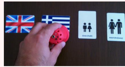
Setting the user’s profile by “listening to” appropriately marked RFID tags