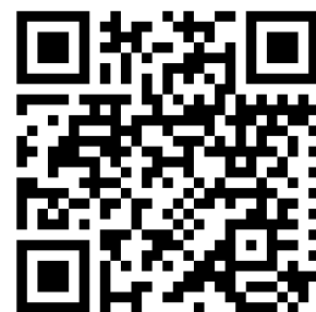
Infoscope web page