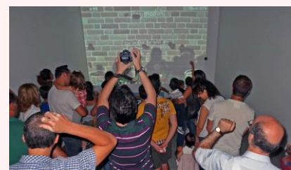
“Athens Plaython” event, Gazi, Athens

Furthermore, the system can support active, fun educational activities for all ages. An educational version of the game, where players have to differentiate among old (i.e., museum items) and contemporary objects, is currently being installed at a museum in Chania, Greece.