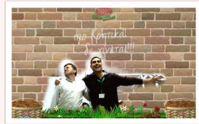
Sample in-game photo