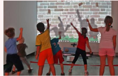
A “heavily” multiplayer game session