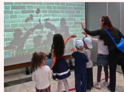
“Tastes & Life” exhibition at the Zappeion Exhibition Hall, in Athens