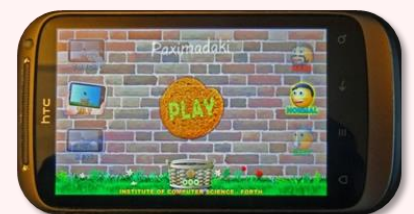
Mobile version for smart phones and tablets (iOS, Android, Windows 8)