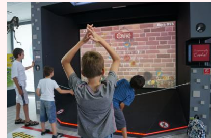
Permanent installation at Heraklion Airport

An app version of the “Interactive wall” system is also available for Android, iOS, and Windows 8 mobile devices (smartphones and tablets).