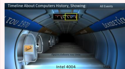
The time-tunnel view of TimeViewer