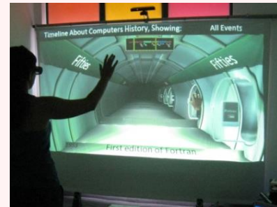
A user interacting with the system

TimeViewer offers a rich and immersive visualization of any kind of temporal information . The content of the system can be provided through existing formal data models, while the visualization is automatically created.