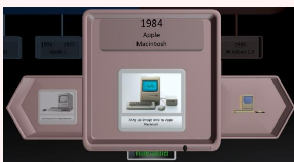
Visualization of an event's multimedia information in the two dimensional view

The implementation of this system involves computer vision technologies.