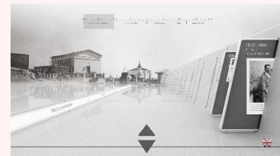
Application interface of Heraklion Archaeological Museum