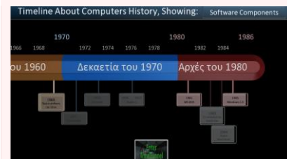
The two dimensional view of TimeViewer

Furthermore, the system is mainly targeted for use in public spaces, intriguing users to engage with the system.