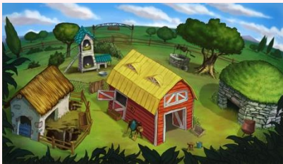
The board of a "Find the correct position" game about farm animals