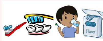
Set of cards for a "Place items into order" game for the activity of tooth brushing