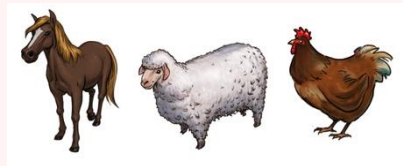
Set of cards for a "Find the correct position" about farm animals