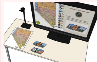
An ambient setup