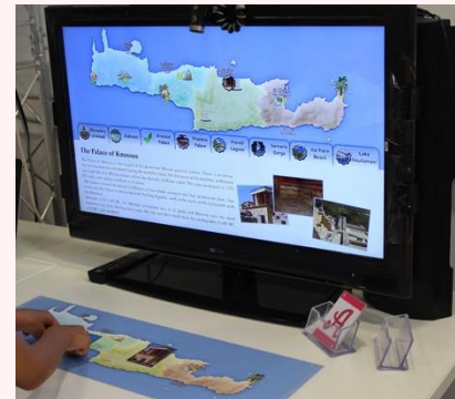
"Find the correct position" card game

The Educational Card Games support learning by playing using physical cards on a tabletop setup, where a simple webcam identifies the thrown cards, monitors their position and translates this information into system input.