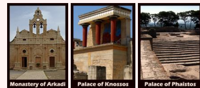
Subset of cards used for a card game for the island of Crete