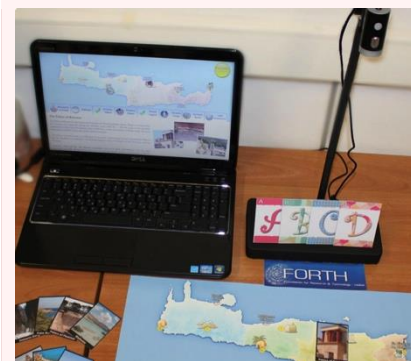
A portable setup