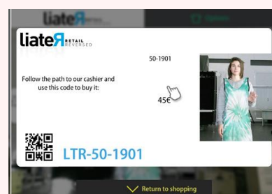
QR code obtained by the system