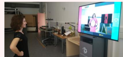
Interacting with Virtual Fitting Room

"Passport" is a code used as a unique identifier that gives access to an online html page containing all the products the user liked, as well as the photos taken by the system. A