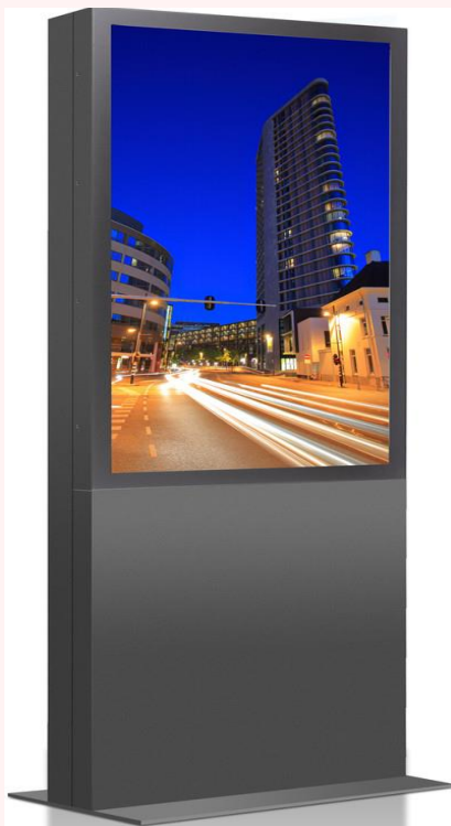
The Interactive Column

Finally the system employs content administration facilities, such as information sources management, and embedding of RSS feeds.