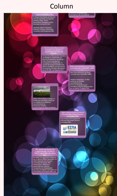
The stream view