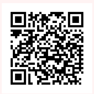
iEat web page

http://www.ics.forth.gr/ami/project/ieat -an-interactive-restaurant-table/