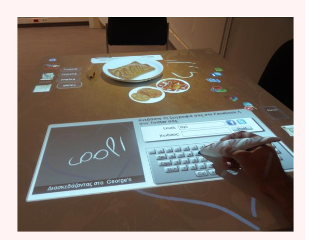
Posting to social media