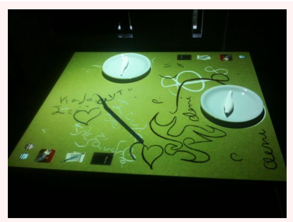
iEat after having been used by two teenagers