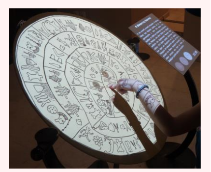
Touching the disk's surface