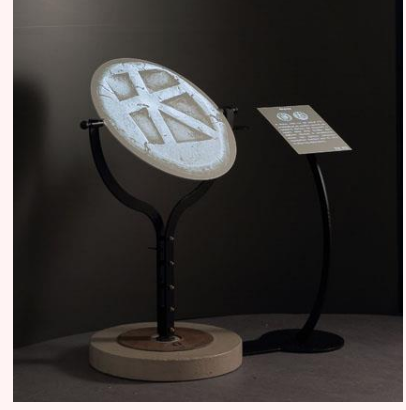
Stater 360<sup>2</sup> coin